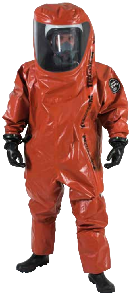
Type CV with sewn-in socks/booties and separate boots.

Trellchem® EVO provides maximum protection against hazardous chemicals in liquid, vapor, gaseous and solid form, including warfare agents. Trellchem® EVO is fully certified in accordance with the American standard NFPA 1991, including the optional chemical flash fire and liquefied gas protection requirements.