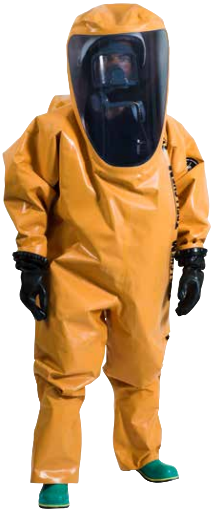
Type VP1 with sewn-in socks/booties and separate boots.

Provides maximum protection against hazardous chemicals in liquid, vapor, gaseous and solid form, including warfare agents. Trellchem ® VPS-Flash is fully certified in accordance with the American standard NFPA 1991, including the optional chemical flash fire and liquefied gas protection requirements. The suit is also certified to the European standard EN 943-1 and EN 943-2.